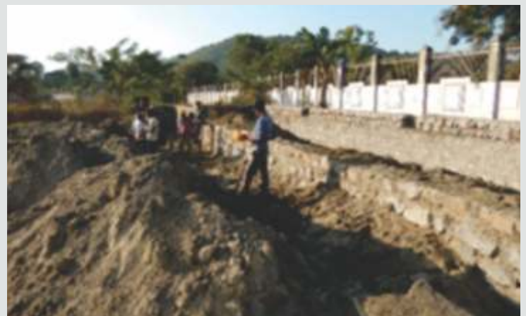
"Bhumi Puja" for Pre Fabricated Laboratory Building, ASTU