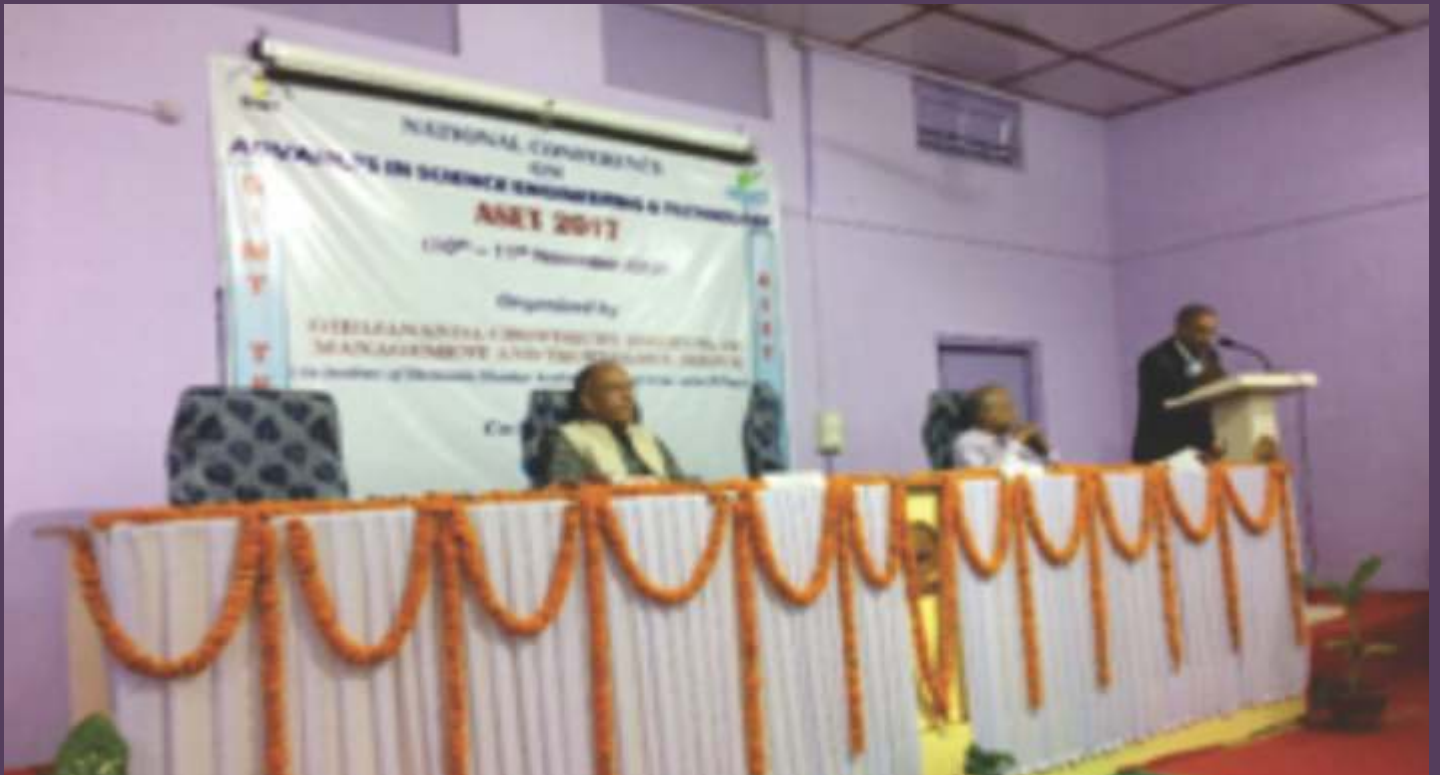
Hon'ble Vice Chancellor, ASTU as the Chief Guest at National Conference on Advances in Science Engineering and Technology (ASET 2017), organised by GMT Tezpur