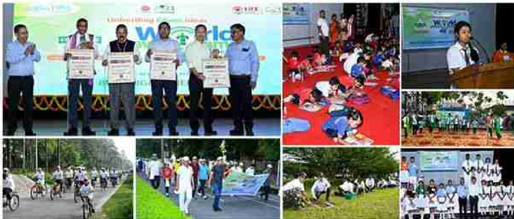
Glimpses of the WED celebrations