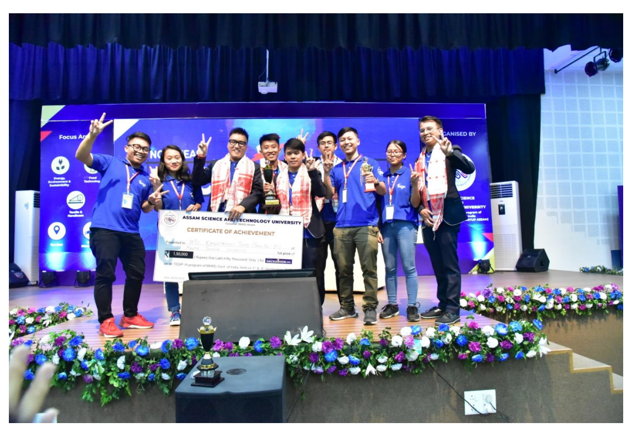
With all the winners of 1st 2nd and 3rd prize: